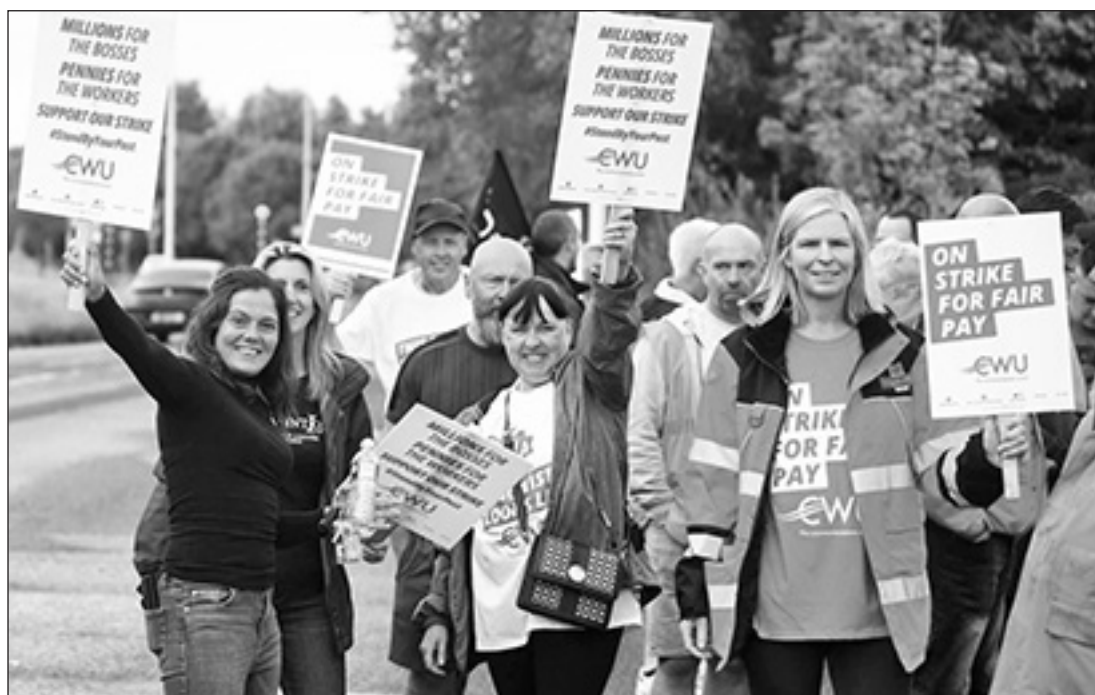
• Postal workers take action.

Royal Mail claims that a lower volume of parcels is damaging its business, resulting in a £219 million loss in the first half of 2022. Royal Mail CEO Simon Thompson has been accused of wanting to break up Royal Mail to focus on parcels similar to DPD with "gig economy"