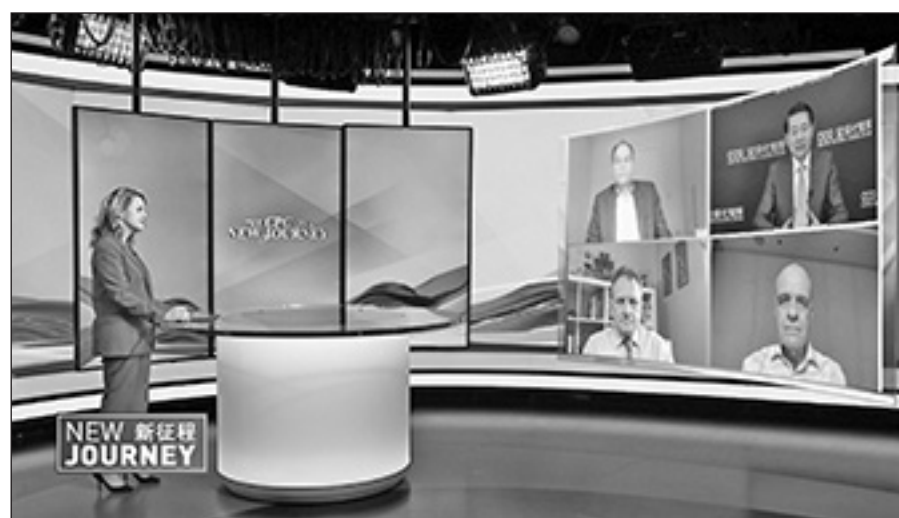
• At the discussion.

China's message to the world is to take a holistic view – thinking about people first, the panellists agreed, summed up in a message to the corporate world from Fudan University's Yin: "Business needs to include much more concerns of the society in general, the social responsibility not only in China, but also globally...engaging with stakeholders instead of shareholders."