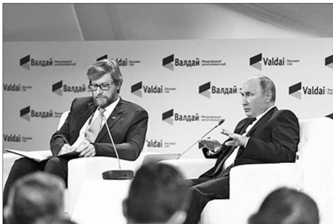
• President Putin, right, at the Forum.

“It’s no coincidence that the West claims that its culture and world-view should be universal. Even if they don’t say so directly, they behave this way. In fact, their approach insists that these values be