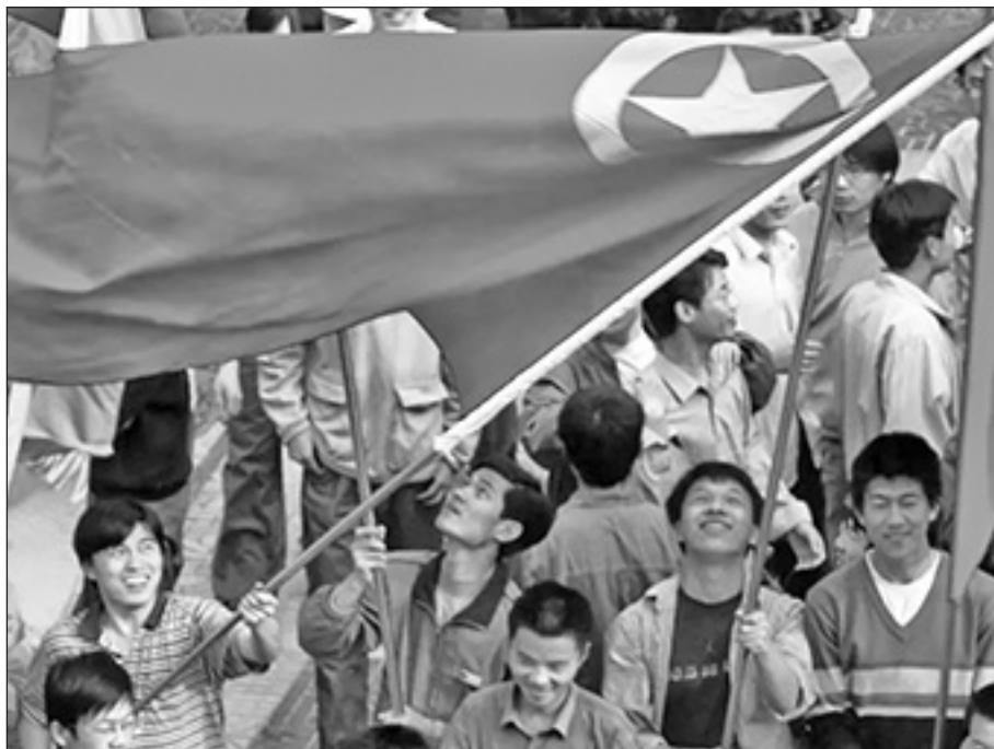
• Young Chinese communists fly their flag.

"We are living in a time when people are so much better off than those revolutionary martyrs and some of China's Generation-Z have already become part of the backbone force in our society. For example,