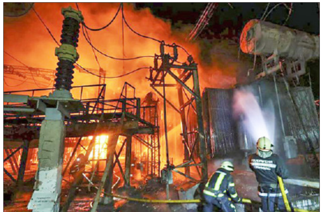
• Energy system hit hard.

Yuri Afonin, the deputy leader of the Communist Party of the Russian Federation (CPRF), told viewers on Russia-1 TV that: “A strong economy is the basis for victory at the front, for strengthening defence capability and for future development.