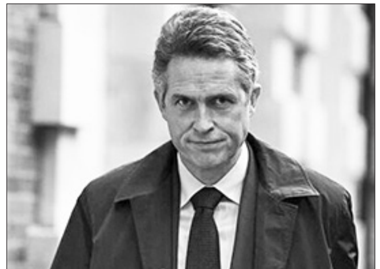
• Gavin Williamson, looking a bit sh** himself.

Williamson has now resigned under pressure.