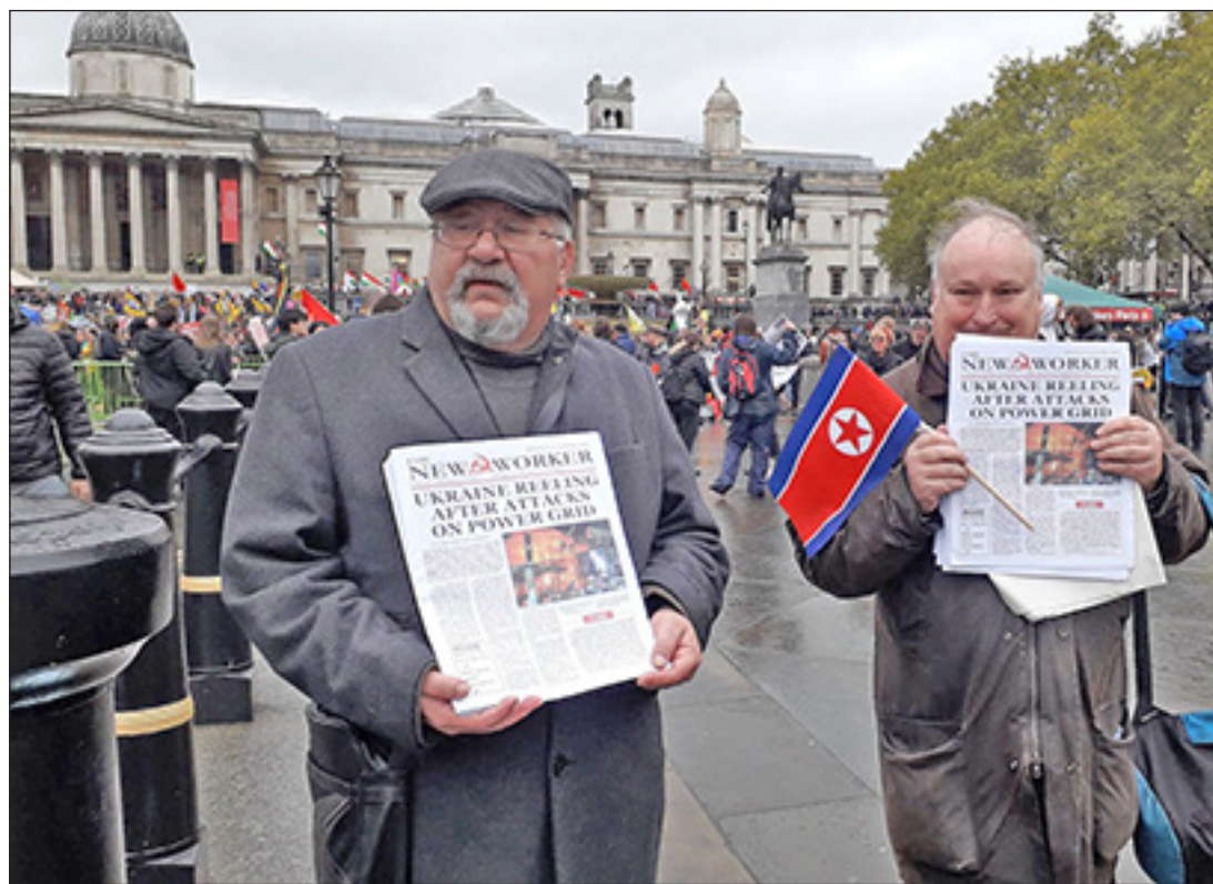
• The New Worker in Trafalgar Square.

The 63,000-strong Chartered Society of Physiotherapists (CSP) are balloting for industrial action in England and Wales, with those in