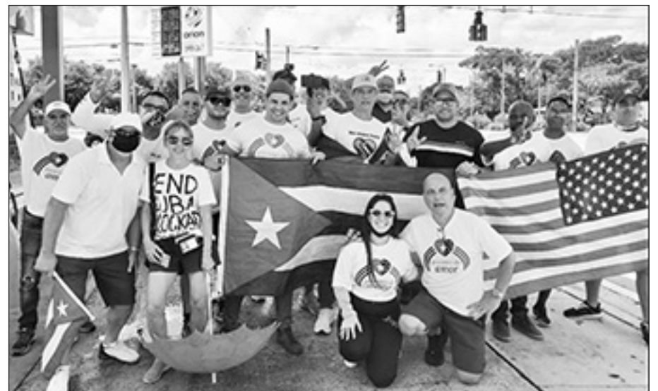
• A caravan marching for Cuba in the US.

In contrast to Washington's position, they highlighted