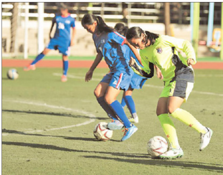
• Young footballers in Shanghai training hard.