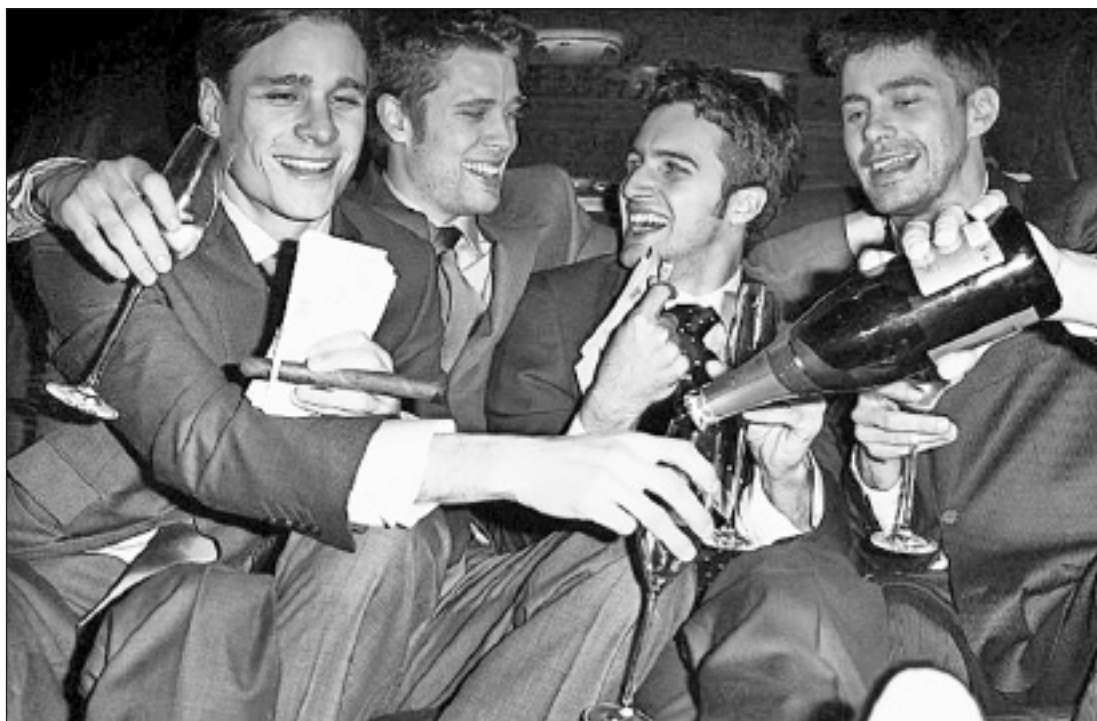
• Young City bankers celebrate in the good times.

This proposition however, holds for total profits; the distribution of post-tax profits amongst capitalists can change depending on who is being given these tax concessions and whose pre-tax profits are shrinking because of the public expenditure cuts. Since typically the tax concessions are given to the big capitalists (it is the top tax-brackets where the rates are lowered), whilst public expenditure cuts lower the level of activity and hence profits more or less across the spectrum, the net effect of both these measures,