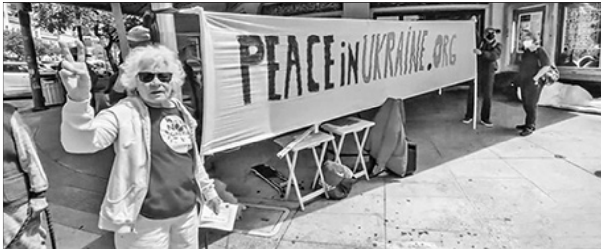
• Protest in the US against arming Ukraine and prolonging the conflict.

nuclear weapons. Their danger is not lessened by their stupidity and arrogance. The USA is currently mired in multiple crises. What can stop the dangerous impulses of the American political elite?