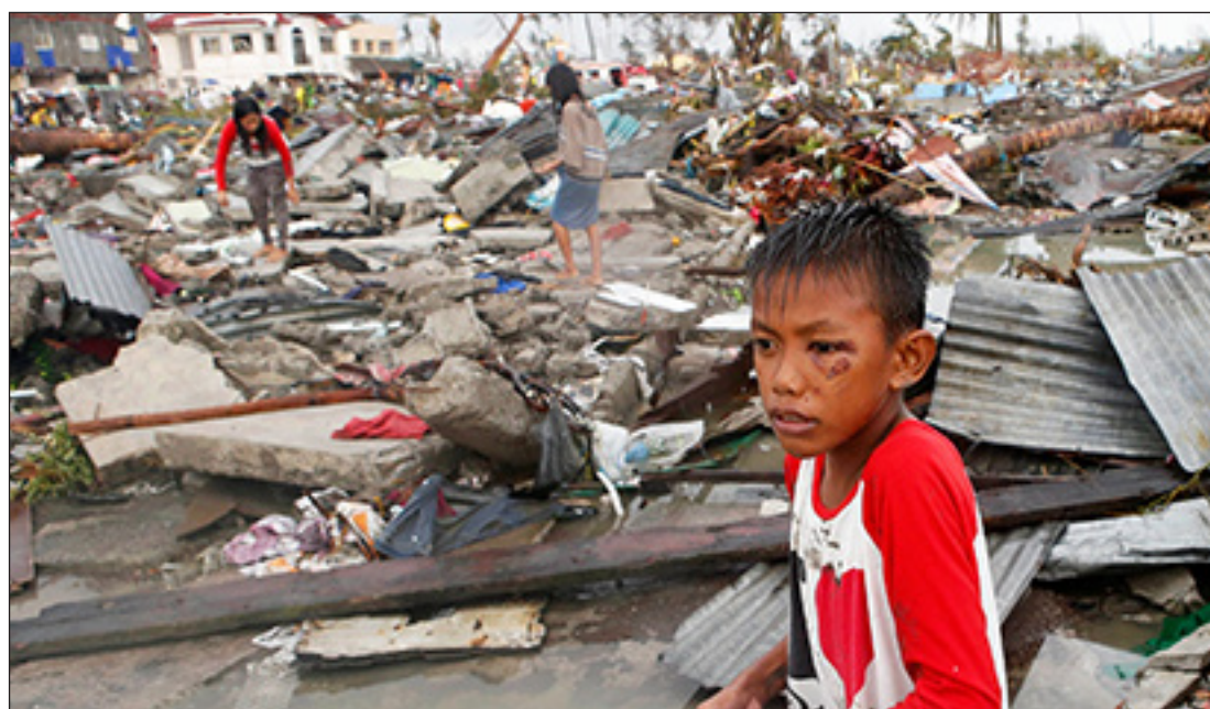
• Climate change devastation in the third world.

Although Sunak lost no opportunity to parade his newly discovered green credentials, he's also used this international platform as a pretext to attack Russia so as to publicly parade his loyalty