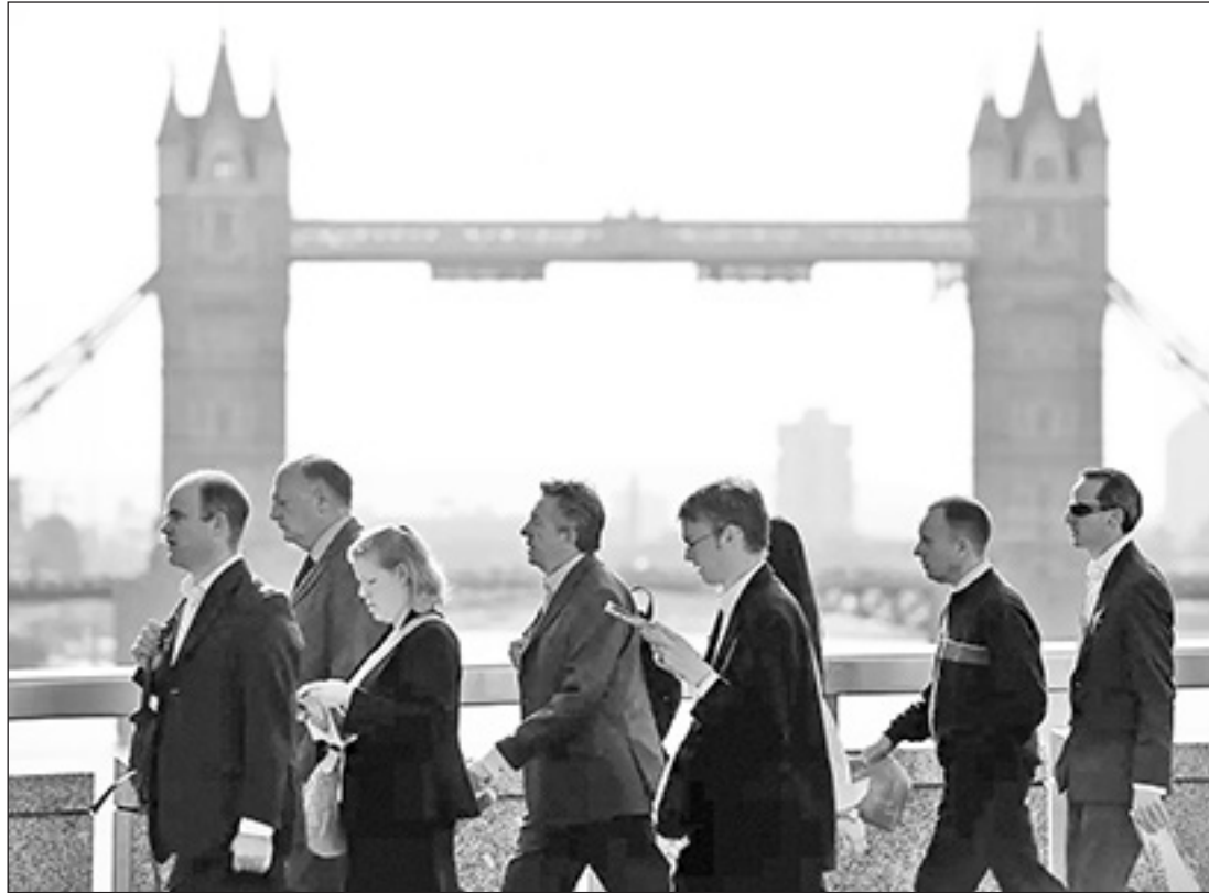
• City workers on the way to the office.

Liz Truss could express a similar sentiment. In fact, one day she firmly declared “I am a fighter, not a quitter”, and the very next day she was out of office through some mysterious process. Within the Conservative Party, a dim, subterranean body called the 1922 Committee, has a decisive voice in the election and continuation in office of a leader. The City operates not only through the ministers and their staff who have City connections or post-retirement ambitions for City jobs, but also through backbenchers who make their presence felt through the 1922 Committee. Since the media are controlled by the financial oligarchy belonging to the City and can be relied upon to shape public opinion, there is in effect an invisible City-dictated polit-