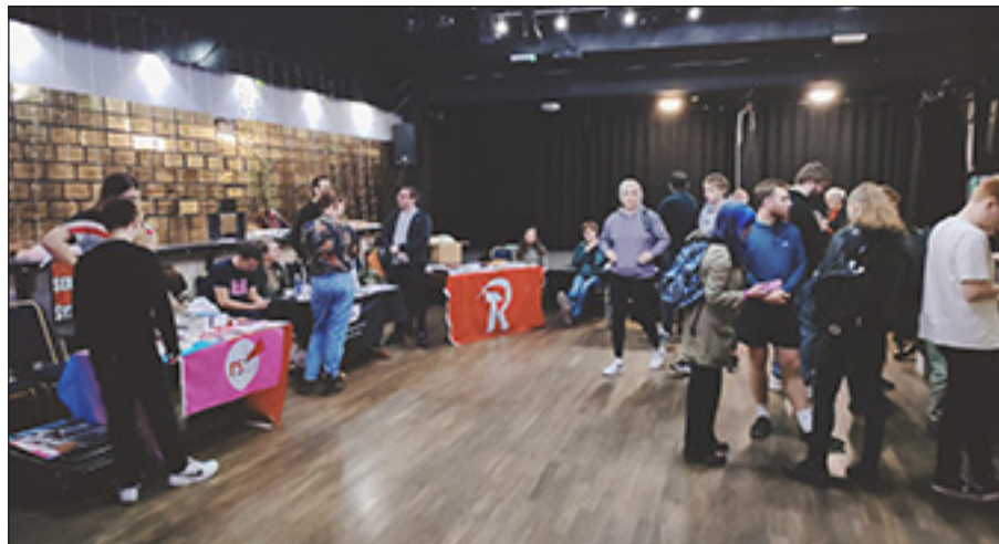
• At the book fair.

The event was the third organised the Red Book Fairs Collective, including members of Red Fightback (RFB) a "revolutionary Marxist-Leninist party". It included stalls from: the Communist Party of Great Britain (Provisional Central Committee); Ebb Magazine , an independent online communist publication; the Industrial Workers of the World (IWW) independent street union; the New Communist Party of Britain (NCP); socialist and labour history book specialists Northern Herald Books; Peace, Land, & Bread , the journal of the Center for Communist Studies; rs21 (Revolutionary Socialism in the 21st