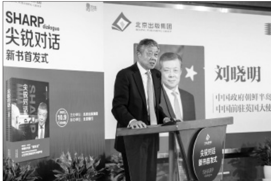
• Liu Xiaoming at the launch of Sharp Dialogue .

lowed, Liu gave many interviews, covering everything from China's stance on COVID 19 and Hong Kong to the country's relationship with the UK, pitting him against many of Britain's best known TV presenters and interviewers.