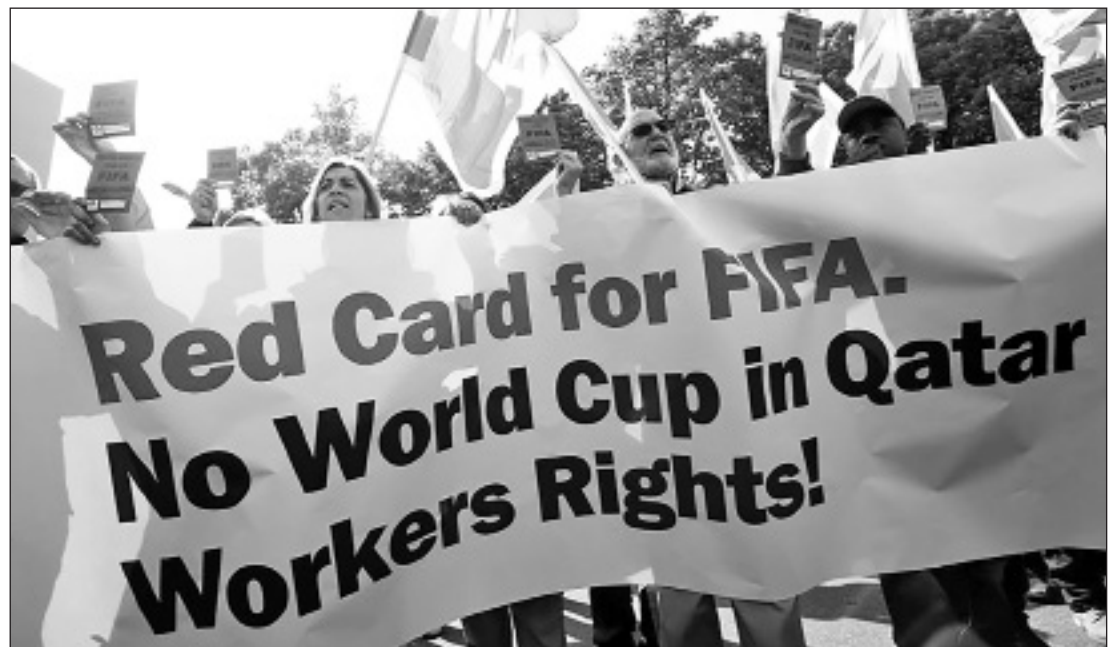
• Protest in the US.

World Federation of Trade Unions Athens 18 Nov 2022