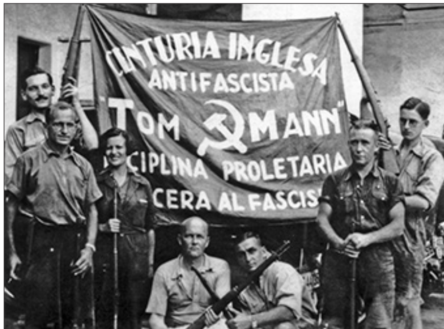
• Fighting against fascism in Spain.