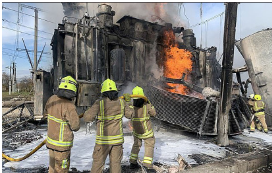
• Power station hit in Kiev.

Although evacuating the capital remains the worst-case option for the Zelensky government the regime has already begun moving people out of Kherson, the provincial capital that the Ukrainians re-occupied following the Russian pull-back on the southern front. Kherson was virtually a ghost town when the Ukrainians arrived. Most people had left with the retreat-