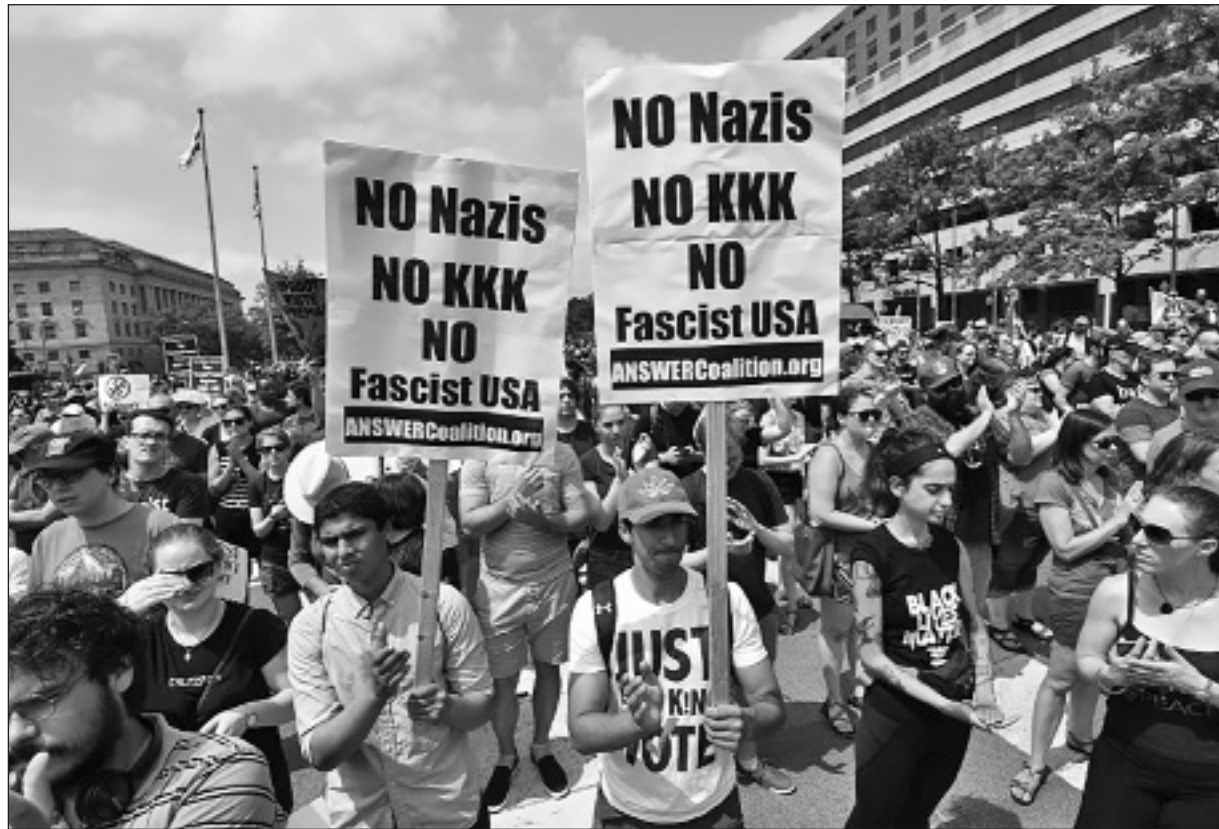
• Marching against fascism in the US.

There is a dialectical relationship between bourgeois democracy and fascism. Fascism is latent in imperialist countries. In