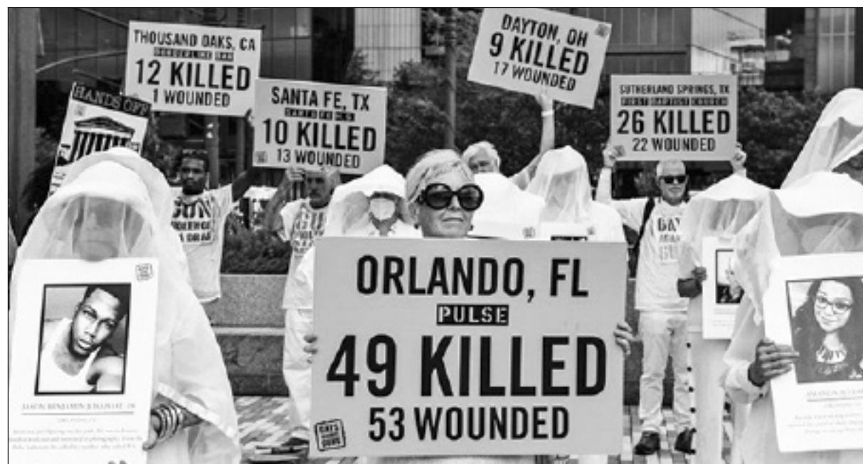
• Mass shootings in the US remembered.