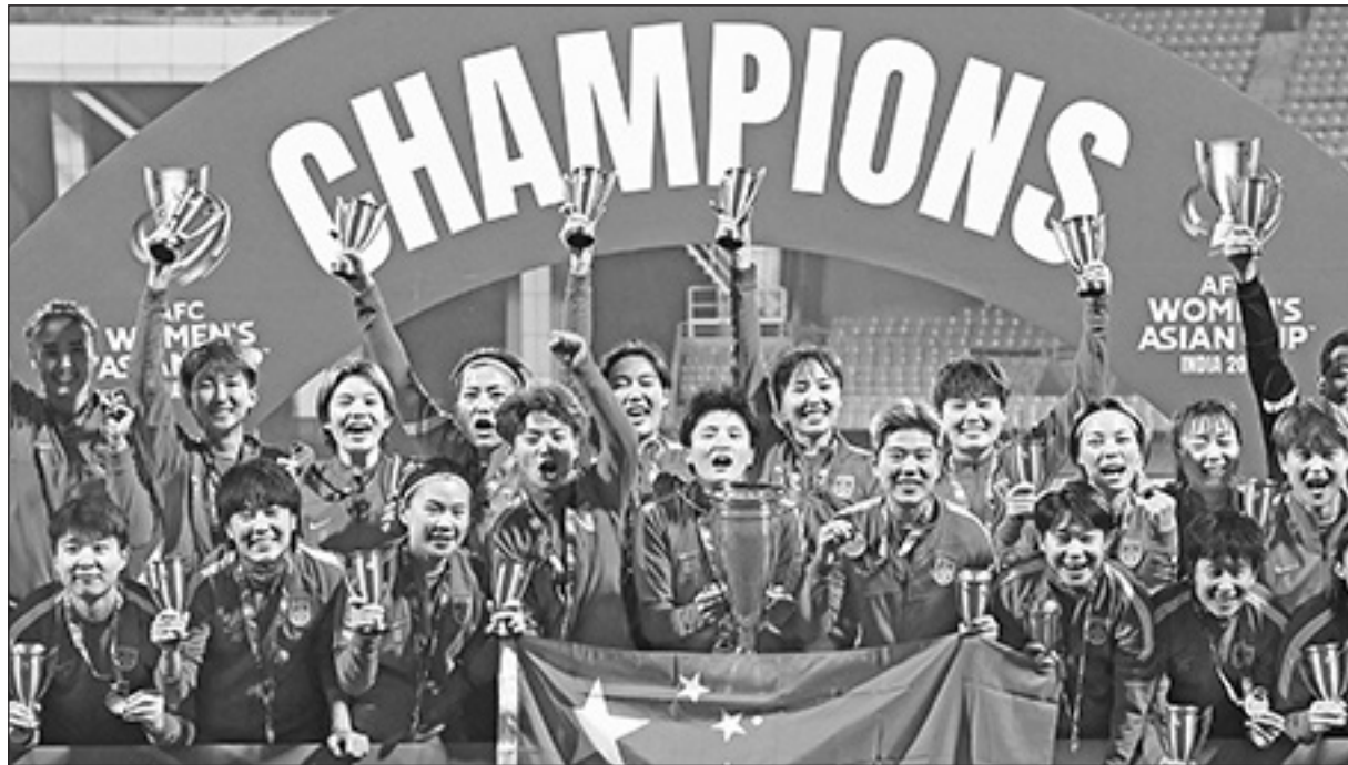
• China won the Women's Asian Cup, 2022.

Products made in China for this year's World Cup range from stadium equipment and new-energy vehicles to footballs, shirts, scarfs and souvenirs.