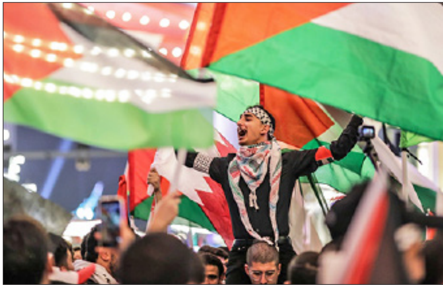
• Palestinian flags fly in Qatar.

"We didn't want to write these words, we are not the story here. But after ten days in Doha, we cannot hide what we are going