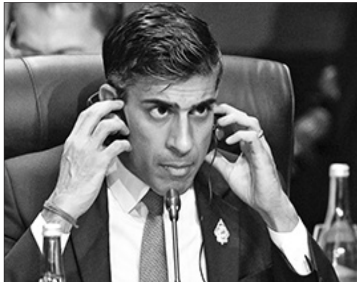
• Sunak in Bali.

If Britain wants to appear to have a foreign policy of its own, it should focus more on its own interests rather than being held hostage to some countries' strategic goals, Cui said.