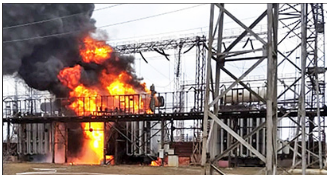
• Power stations pounded.

"Ukraine and Poland today are the main reserves of West-